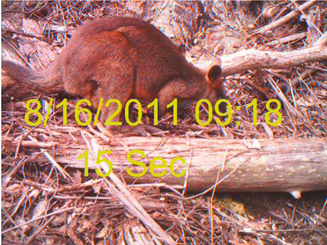
APPENDIX A Figure 4.